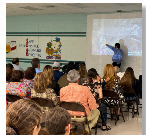
A public meeting was held on Nov. 6, 2019 to gather input for the study.