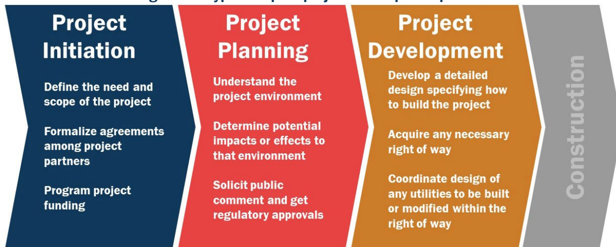
Figure 2 – Typical capital project development process

Cost estimates in this appendix are provided in tables similar to Table 2 . Many recommended capital projects have been organized as components combined into project packages. Information about project extents, length and acreage of right-of-way is included. The page number in the main report where more detail about each project is found in the top right corner of each table. A 20% contingency was placed on the construction cost to account for variability and unknown factors. Estimates in this study are considered to be fairly conservative, assuming challenging site conditions and using the most durable materials. As development of the project progresses, some savings may be realized. In some cases, the right-of-way cost may be negotiable with the property owner, though this should not be assumed. Property values, particularly in the denser locations where these projects are being proposed, are particularly high and therefore right-of-way costs can be fairly substantial, depending on the project.